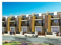
ROYAL BUNGALOWS SHIVALAYA