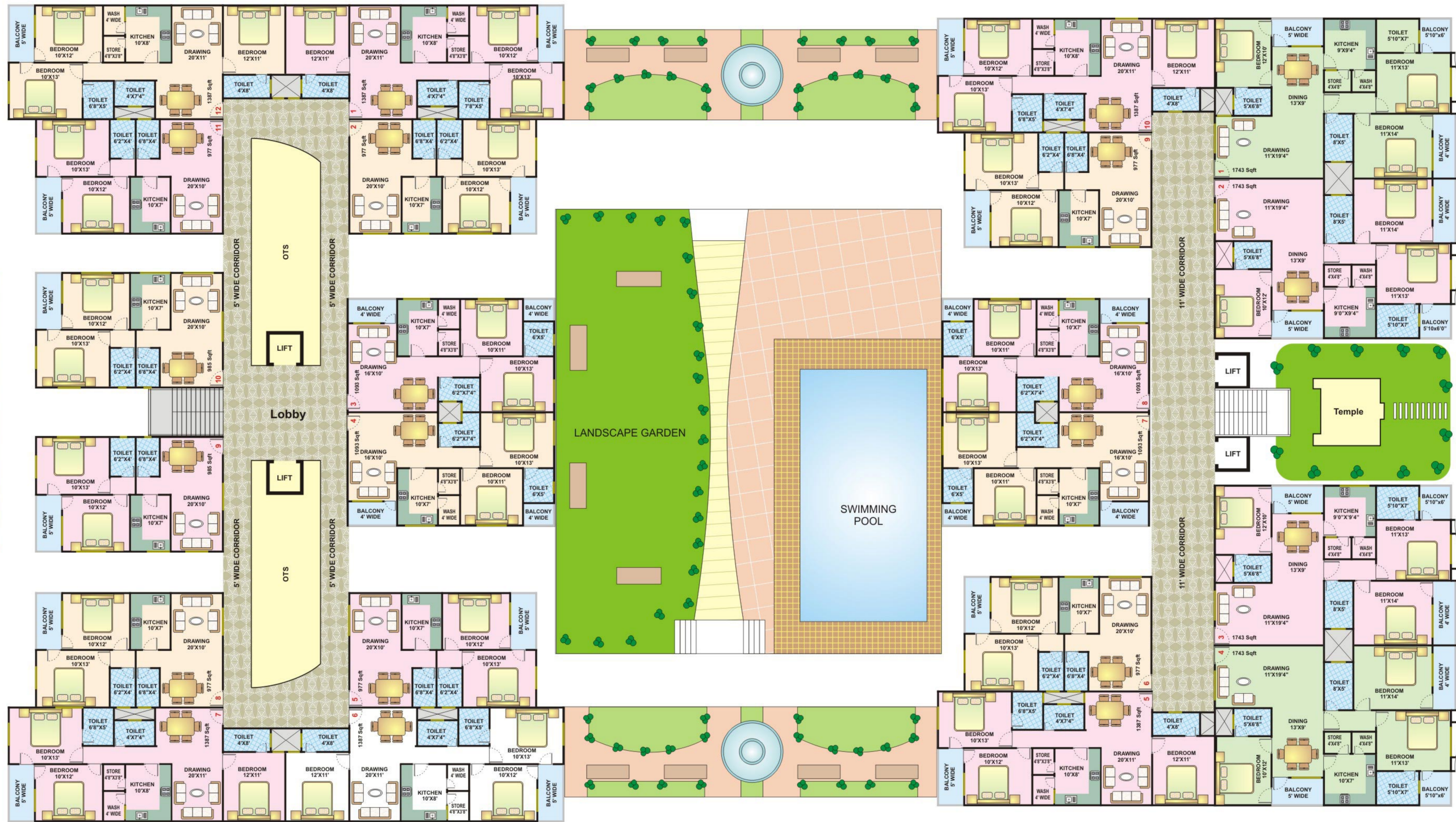
BLOCK - B