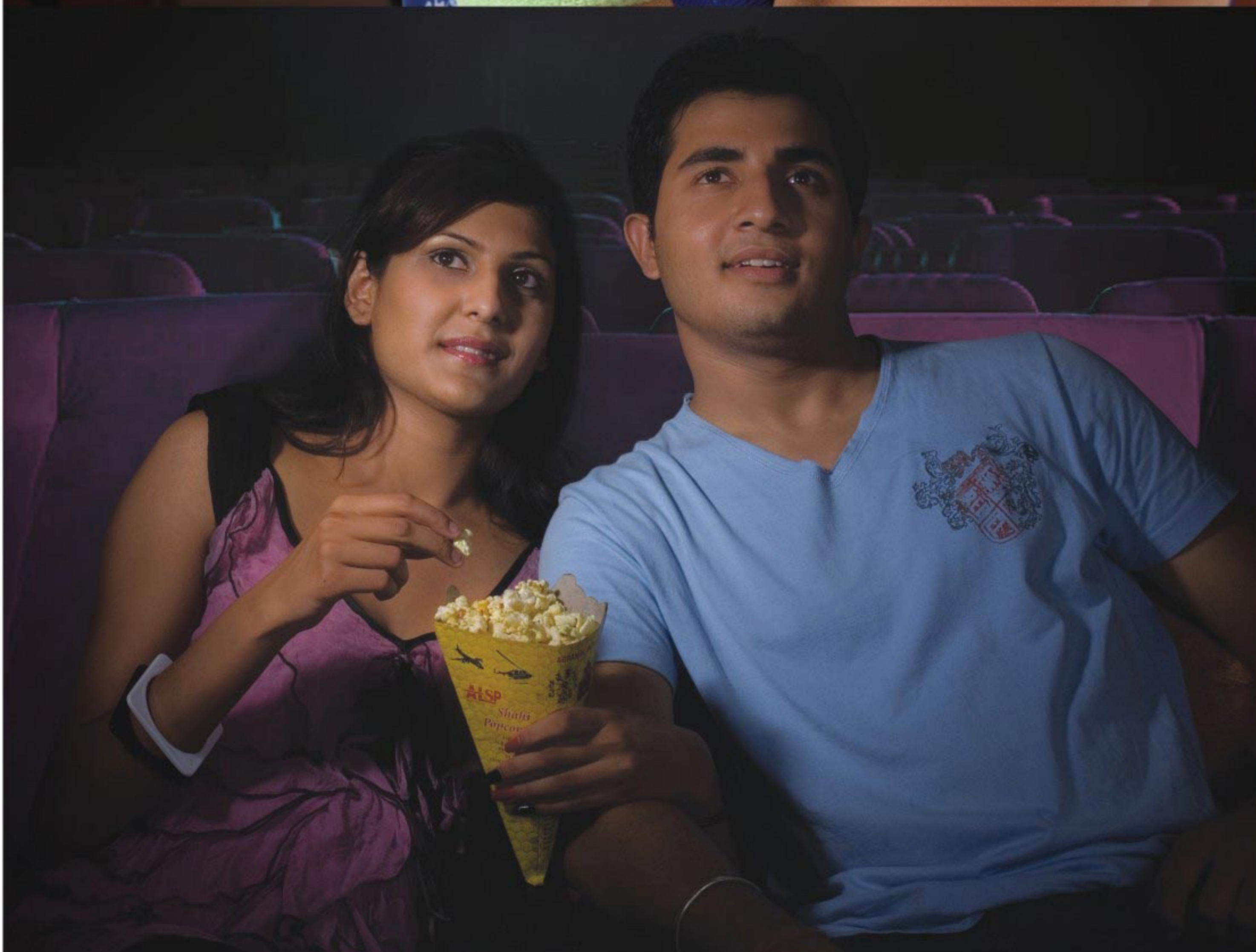
■ MOVIE LOUNGE