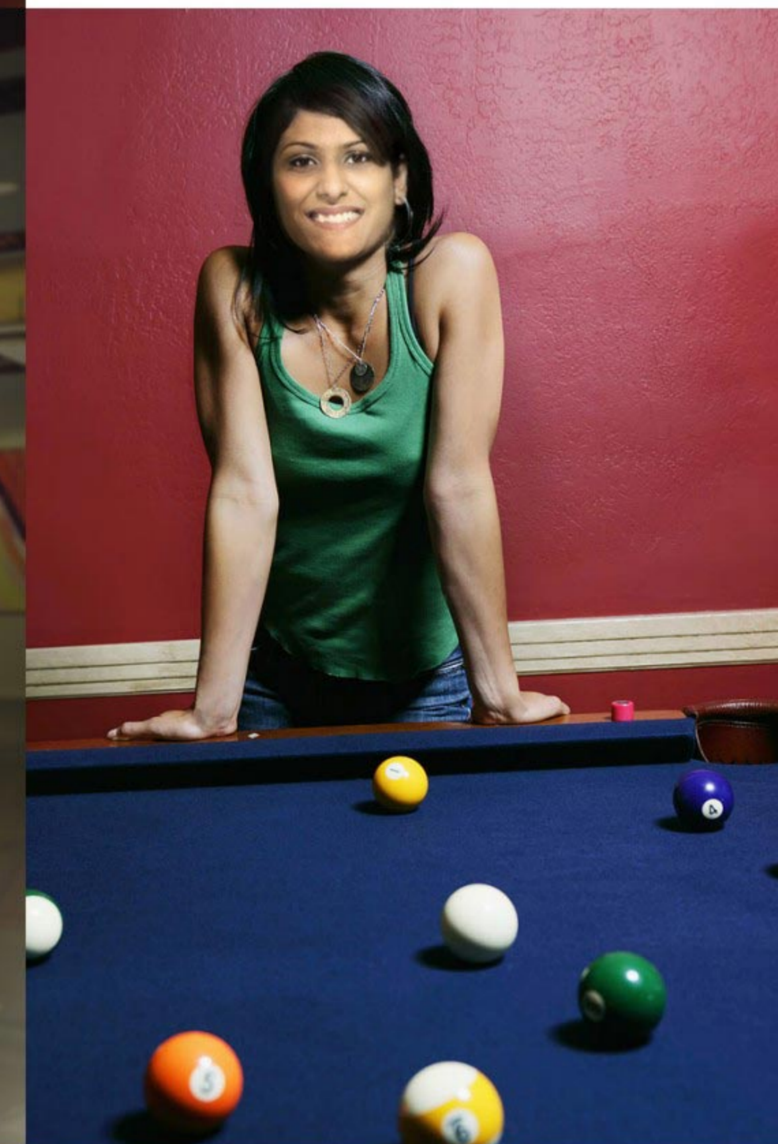
■ POOL TABLE