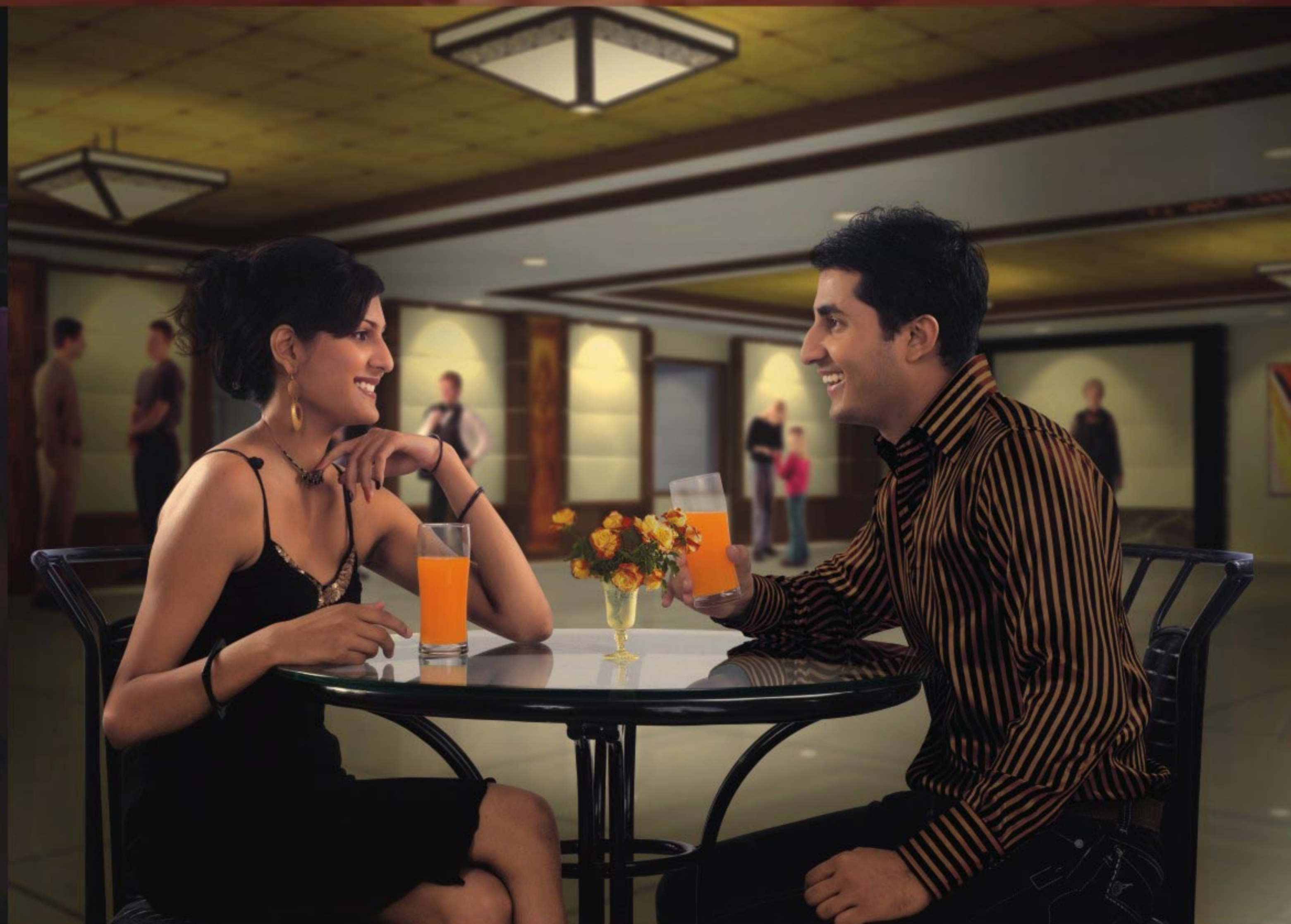
■ PARTY HALL