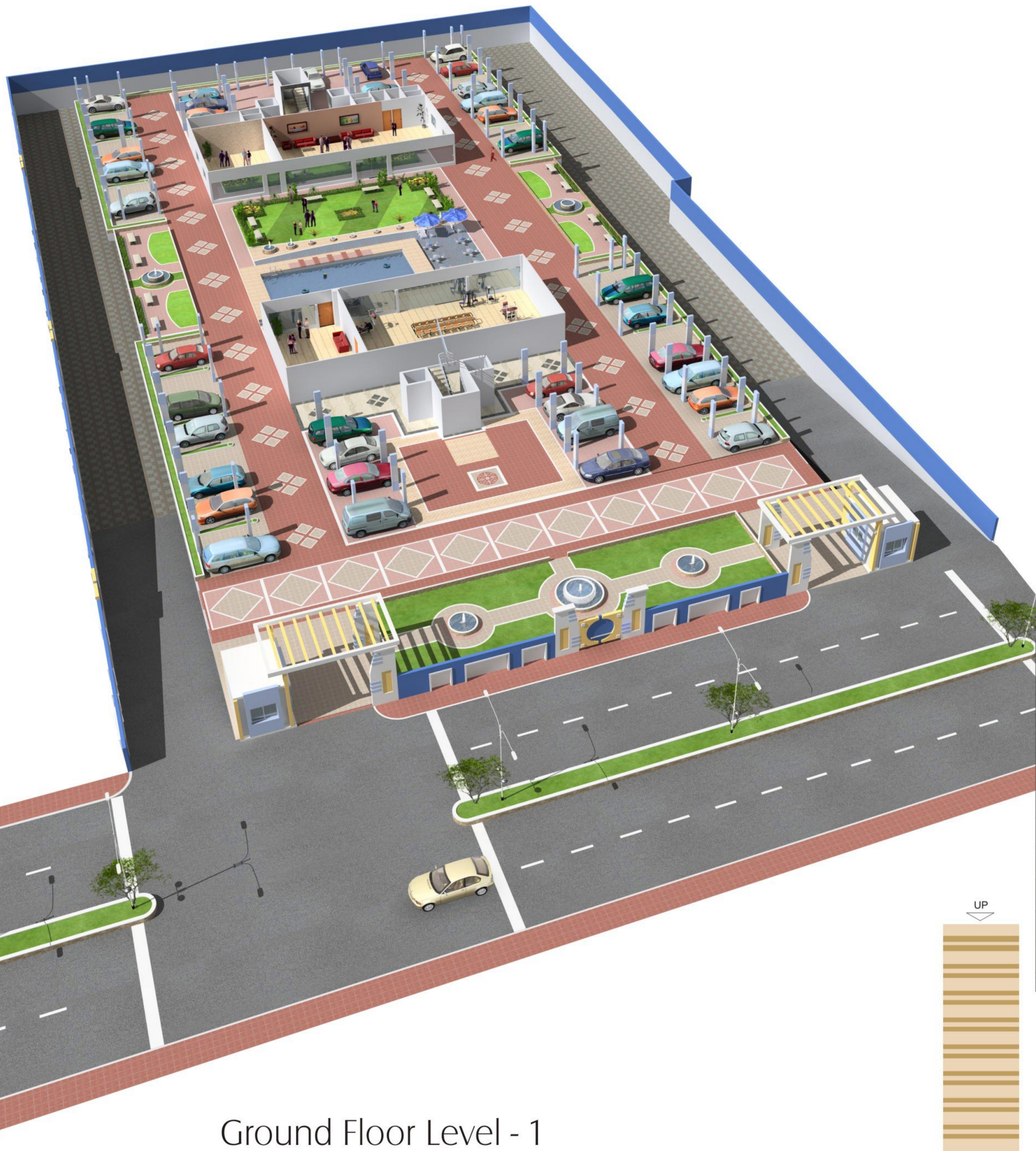
Ground Floor Level - 1