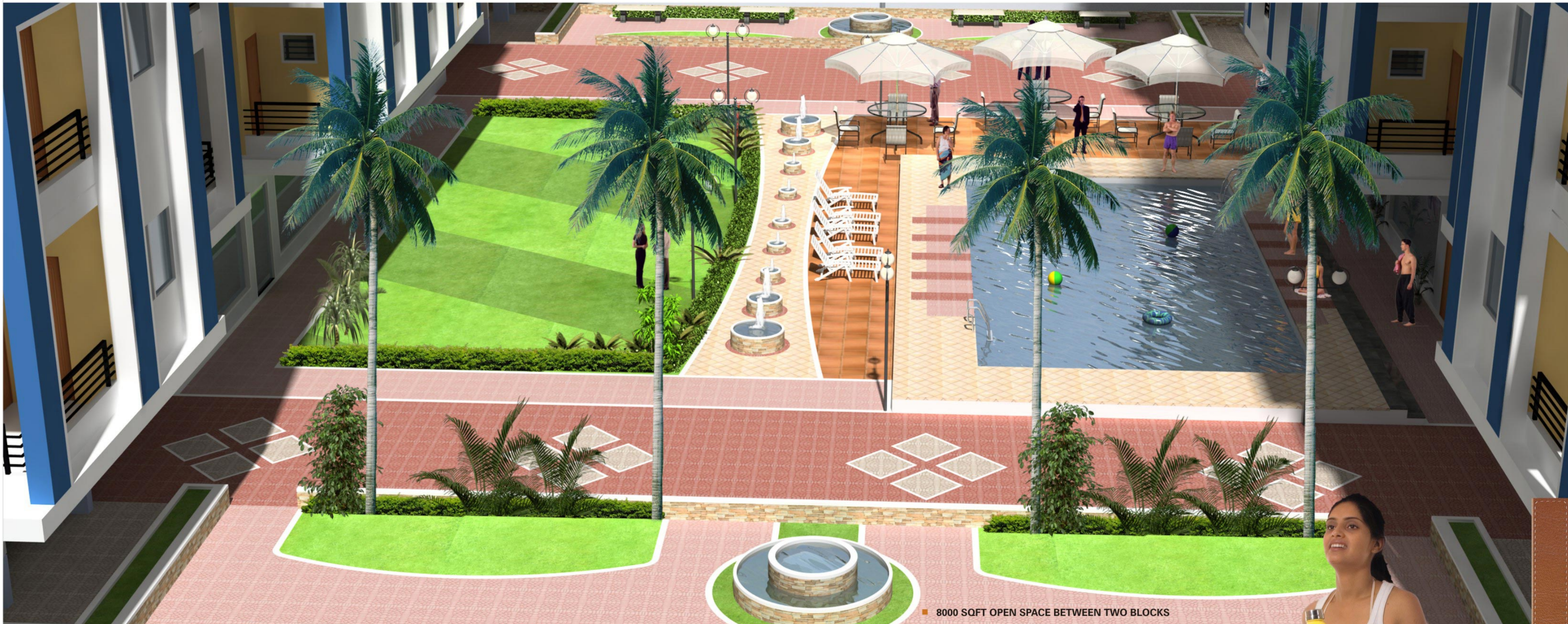
8000 SQFT OPEN SPACE BETWEEN TWO BLOCKS

Two side open apartments have a beautiful side - Happiness.