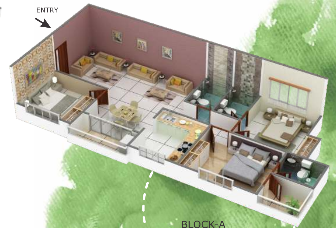
BLOCK-A FLAT NO. 14 3 BHK