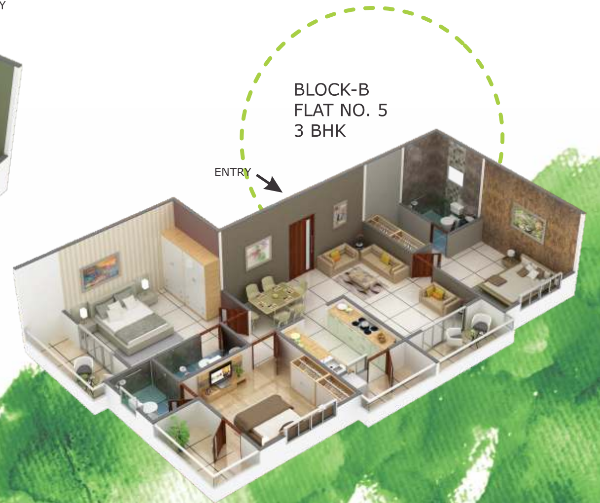
BLOCK-B FLAT NO. 5 3 BHK