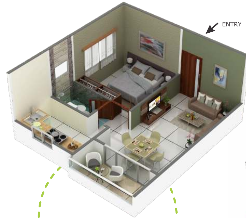
BLOCK-B FLAT NO. 4 1 BHK