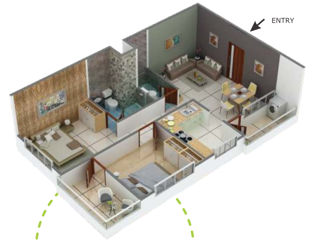
BLOCK-A FLAT NO. 9 2 BHK