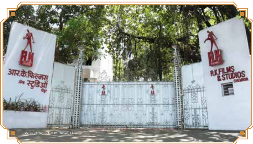
Actual photograph of RK Studios, Chembur

A land that pioneered the art of storytelling as we know it today, a piece of cinema history in its own right, a place that exudes magic that continues to live on even after 71 long years.