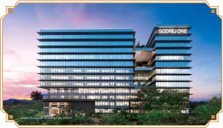
Actual photograph of Godrej One, Vikhrali

A 122-year old story that began with locks and safes, a brand that has given shape to many landmarks across the country, a company rooted in trust, commitment, and sustainability.