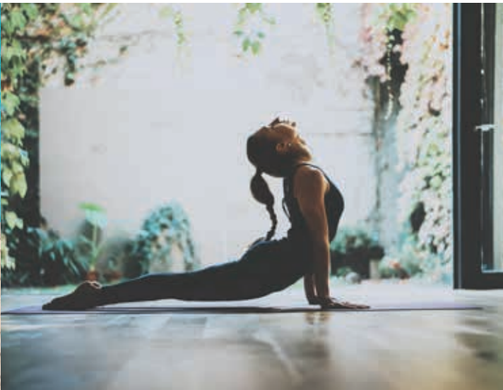
Table tennis room Yoga/ Meditation room Multipurpose hall Terrace Party area and barbeque Fully-equipped gym